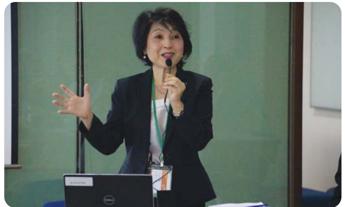
Malaysian Japanese Language Education Seminar