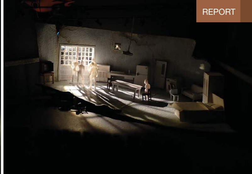
One of the set designs by the participant