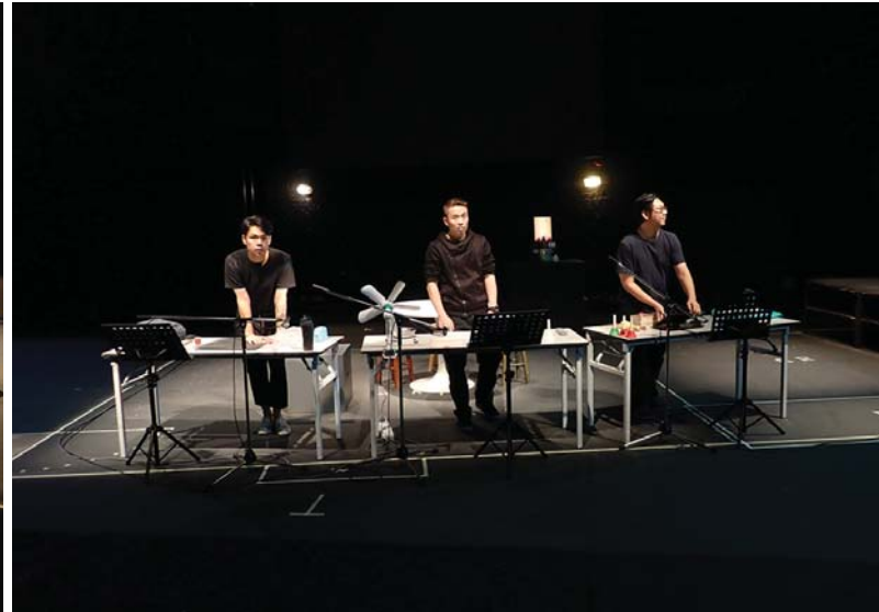
Presentation by the sound design team