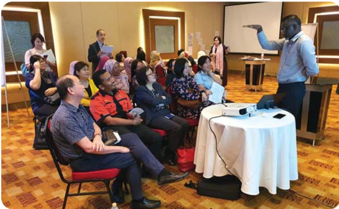
2019 Japanese Speakers' Forum in Malaysia

Upcoming Events Teacher's Training via ZOOM