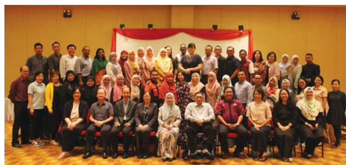
All participants with JFKL and Ministry of Education officers