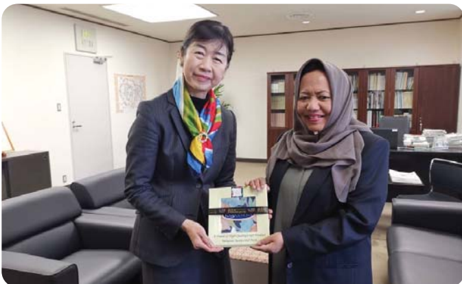
The Japan Foundation Asia Center Invitation Program for Cultural Leaders