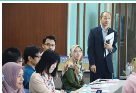
During the lecture