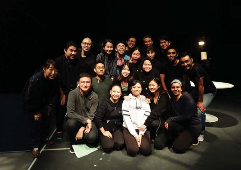
The participants with the facilitators