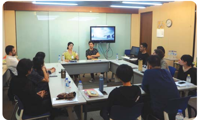
JFKL Curatorial Workshop