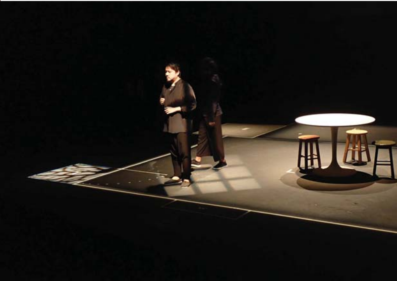
One of the light designs by the participant