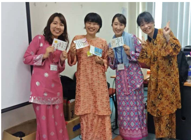
STNPs showing the handmade postcards from the students