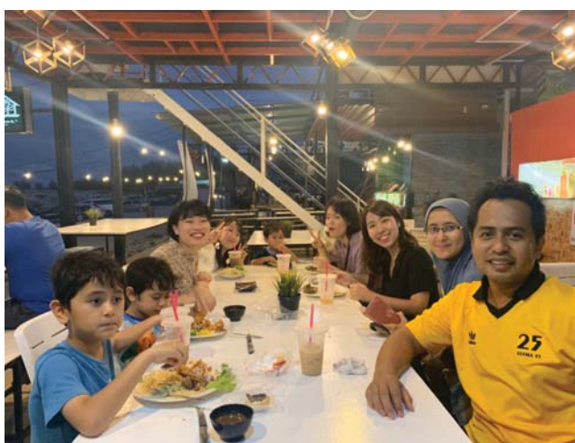
STNPs having a meal with one of their host families