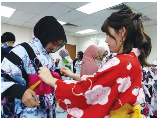
STNP teaching students how to wear Yukata