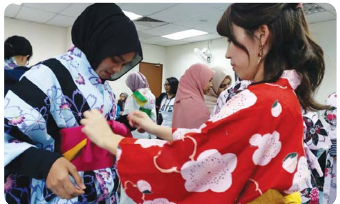
Short Term Nihongo Partners Program