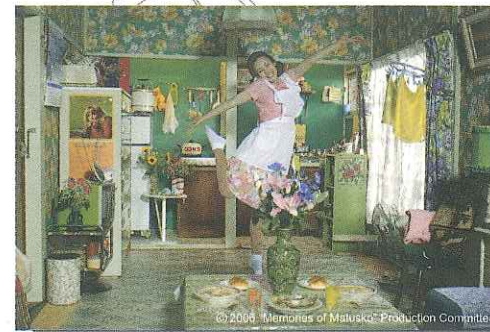
Memories of Matsuko