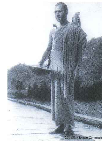
Harp of Burma