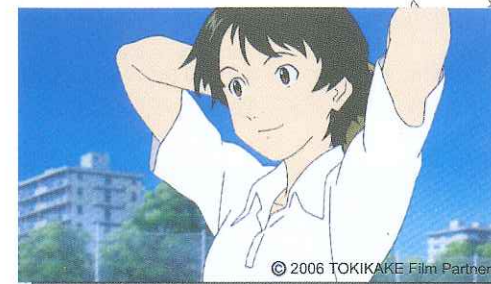
The Girl Who Leapt Through Time