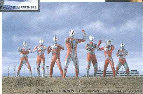
Ultraman Mebius & Ultraman Brothers