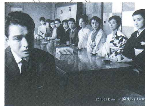
Ten Dark Women

KUALA LUMPUR Duration: 17 (Thu) - 21 (Mon) July 2008 Venue: GSC Mid Valley & GSC 1 Utama (new wing) Ticket: RM5 per screening