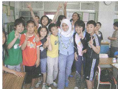
Photo 2: The friendly kids from class 5-2 7th Hakata Elementary School

I could write pages about my trip, unfortunately there is a limit. But I would like to express here my heartfelt and sincere thanks to the Japan Foundation, Japan Government, the coordinators, the tourist guides, all NGOs/NPOs that participated, the schools and university that participated, my lovely home stay family, and those whom I didn't mentioned here. Not to forget the other 47 participant from the 15 countries. The 14 days journeys with you guys were one of the most precious moments in my life. Doomo arigatou!!!!!!