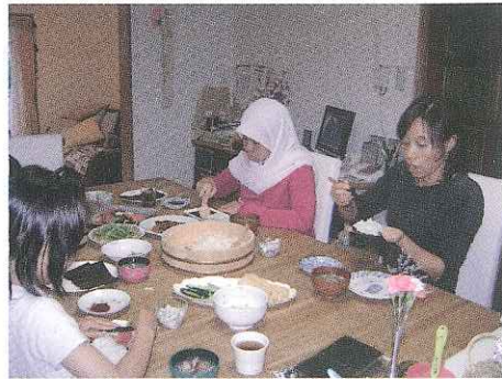
Photo 1: Itadakimas!! Having my ala-Japanese dinner with my home stay family