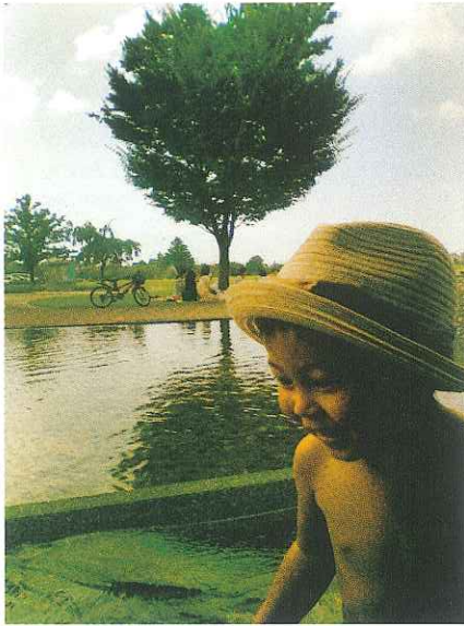
Kanazawacitizencentre: Kanazawa's Citizen Art Centre is an arts utopia, and looks like KLPac