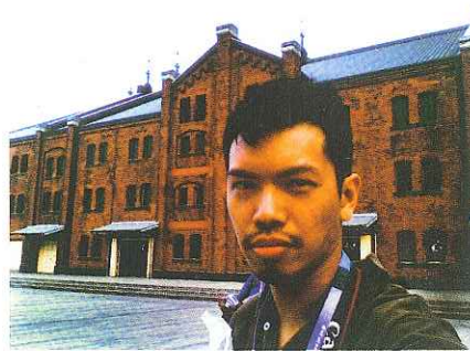
Redbrickhouse: The Yokohama Redbrick Warehouse, former harbour facility, now arts and shopping centre

In the end, we KL folks need to first imagine that the city is ours, and that we have the right to dream a better future for it. And that we have the right to express that dream, and to share it with people with different dreams. The city is big enough. If not, then let us make it big enough.