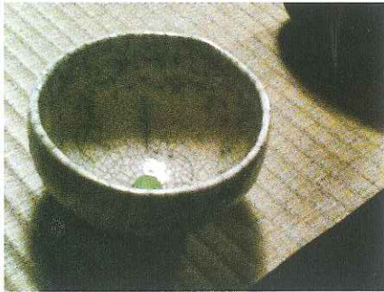
Teabowl: The teabowl that Pang drank from in Ohi Museum, Kanazawa