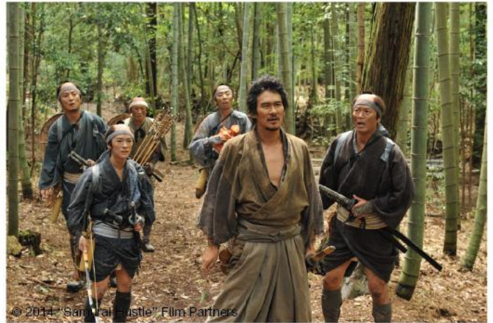
© 2014 "Samurai Hustle" Film Partners