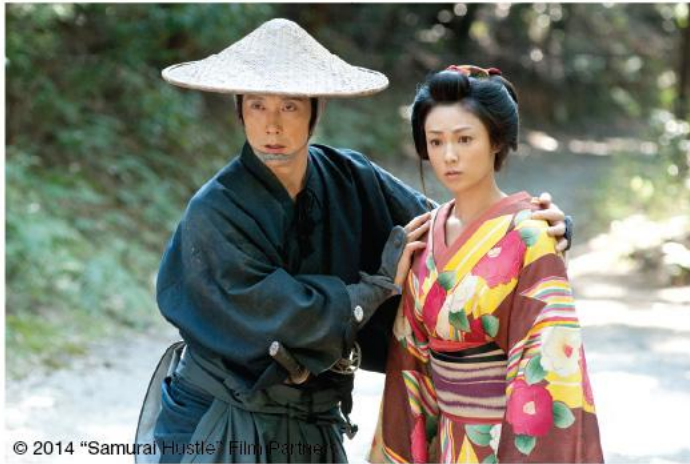
© 2014 "Samurai Hustle" Film Partners