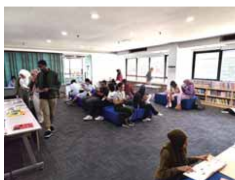
The Tadoku Session