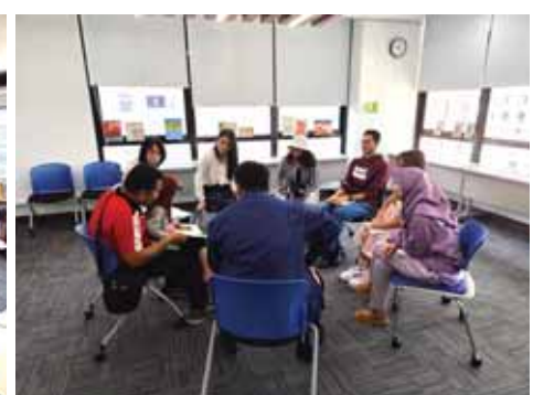
The Book-Talk Session