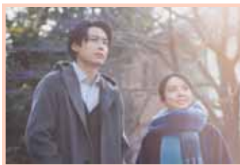
© Maiko Seo / 2024 "All the Long Nights" Film Partners

幕末の侍があろうことか時代劇撮影所にタイムスリップ。「斬られ役」として第二の人生に奮闘する姿を描く、コメディでありながら人間ドラマ、そして手に汗握るチャンバラ活劇!