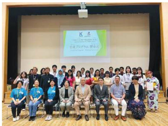
The group photo