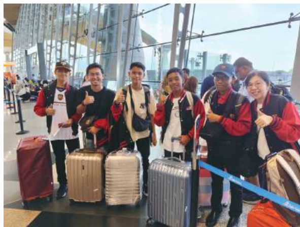
The Malaysian representatives: 2 teachers and 4 students

The Japanese Speakers' Forum 2024 provided both teachers and students with valuable opportunities to develop their Japanese language skills, exchange cultural insights, and engage in discussions on key educational and global themes. Looking ahead, we hope to see the realisation of the key goal of the program, which is the cultivation of a "Nihongo-jin" (Japanese speakers) community, where individuals use the language to contribute meaningfully to society.