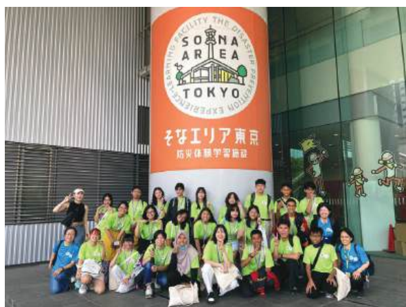
Student Program: Fieldwork at Sona Area Tokyo