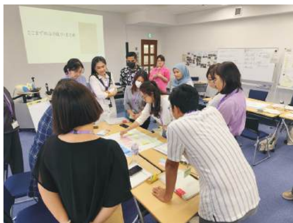
Teacher Program: Group discussion