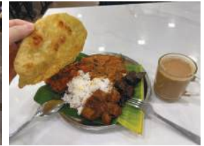
Banana Leaf Rice