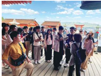
Short trip to Miyajima