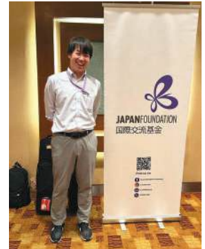
Myself with JF Logo