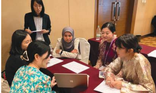
CP-NP activities presentation session

The 10th Batch NIHONGO Partners have departed to Japan on 7 November after 8 months serving as teaching assistants to the local Japanese language teachers in Malaysia. NIHONGO Partners (NP) Programme, one of the core programmes under WA Project 2.0, dispatches selected Japanese citizens called NIHONGO Partners or NP to secondary schools in Asia since 2015. The recent 10th Batch consisted of 9 NP who had been dispatched to secondary schools from 28 March 2024, in 7 states in Malaysia (Kedah, Penang, Kelantan, Selangor, Kuala Lumpur, Negeri Sembilan, and Johor). While assisting the Japanese language teachers as their counterparts, these NP were also tasked to spread the charm of Japanese language and culture to school communities and their local area.