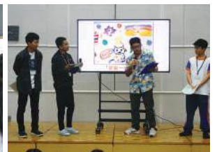
One of the presentations on what they perceived as "happiness"