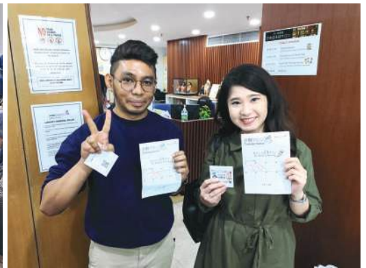
The "Stamp Rally" winners