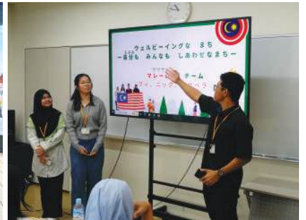
Presentation by Malaysian team on well-being