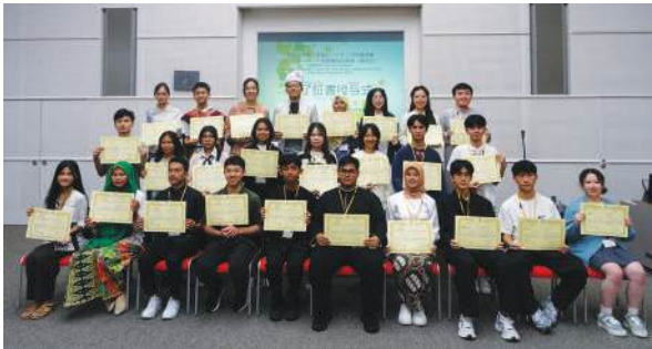
All 26 participants from 7 countries

All 3 Malaysian participants also had the opportunity to represent all participants in delivering a closing speech at the end of the exchange programme with Izumi High School Students on 27 October and during the closing ceremony of this programme in the evening of 29 October.