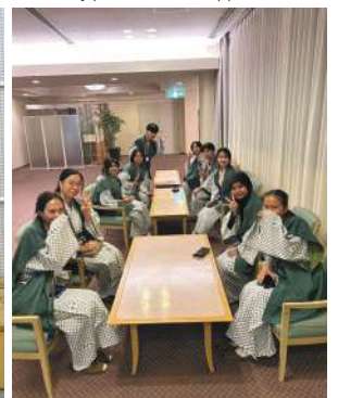
Experiencing Japanese-style resort during Hiroshima & Kyoto trip