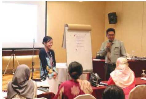
NP and CP sharing session