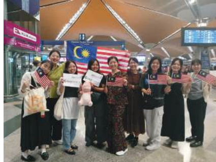
NP in KLIA before departing to Japan