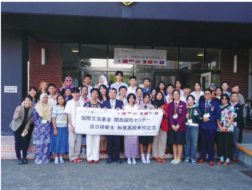
Visit to Izumi High School